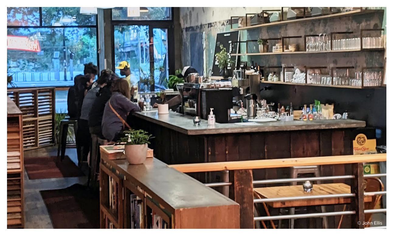
Figure 1 Currency Exchange

Recently, the Chicago Department of Planning and Development established a group of architects, artists, and academics to provide an extra layer of review for major developments before they are built. Included in the 24-member Committee on Design is Theaster Gates, an artist and urban planner best known for reimagining out-of-use spaces in ways that center the needs and values of African Americans on the South Side of Chicago. In one such example, Gates converted a former currency exchange laden with commentary on the inadequate infrastructure in this majority-Black communityinto a space where people can gather for coffee, conversation, and food for thought. Aptly named the Currency Exchange (Figure 1), the space privileges culture as currency with artists in residence, meeting and performance space, shelves lined with books, local artwork on display, and seats curated to