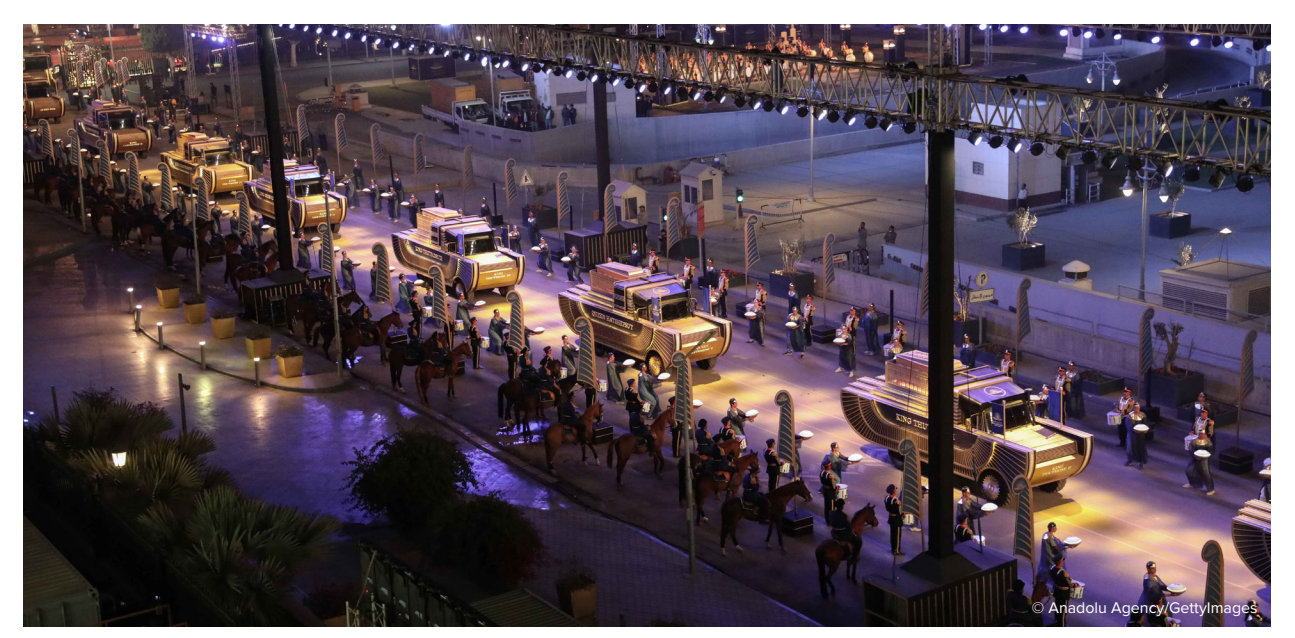
Figure 1 Pharaohs' Golden Parade

center, in what was dubbed the Pharaohs' Golden Parade<sup>1</sup> (Figure 1). A half-mile to the north of this staged event, cranes were rapidly undertaking the construction of the Maspero Triangle project, a widely debated and controversial plan led by the Cairo governorate under the Ministry of Housing that involved the demolition of a historical district and