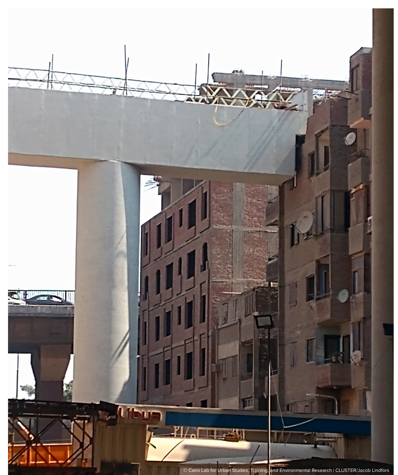
Figure 3 Flyover abutting informal housing