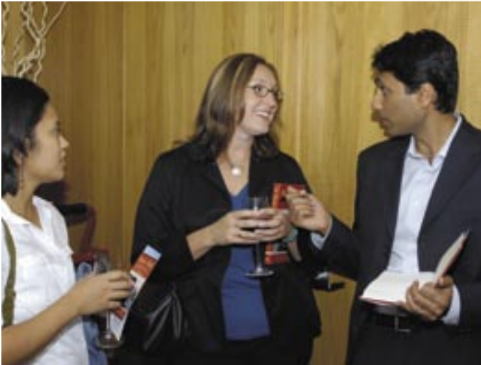
Eboo Patel, author of Acts of Faith: The Story of an American Muslim, the Struggle for the Soul of a Generation , met and spoke with audience members before his talk.

“This is clearly one of the major issues of our time,” said Eboo Patel, of the growing number of youth on the frontlines of religious violence worldwide. Patel, founder and executive director of the Interfaith Youth Core, spoke to a Chicago Council audience of more than 200 at The James Hotel, on Thursday, September 20, 2007, about the struggle to achieve global tolerance for religious pluralism.