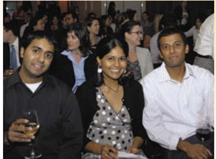
The Chicago Council’s YP programs draw large audiences of young Chicagoans from diverse academic, professional, and cultural backgrounds

The Council’s YP programs draw large audiences of young Chicagoans from diverse academic, professional, and cultural backgrounds, and attendance is on the rise. YP membership in The Chicago Council also has increased to more than 600 individuals, the highest level in the past five years.