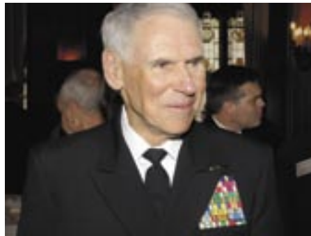
January Luncheon Speaker Admiral William Fallon

Admiral William Fallon, nominated by President Bush to lead U.S. Central Command, spoke to a sixty-person audience at a luncheon on January 22 to kick off the 2007 season of President's Circle events. The President's Circle offers unique opportunities for individuals to engage more actively with The Chicago Council and interact more directly with prominent national and international figures.